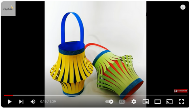
How to Make Paper Lantern for Diwali and Christmas Decoration | Diwali Decoration Ideas