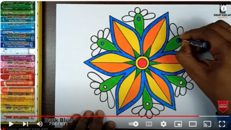
Diwali Rangoli Design Easy | Diwali Drawing | Easy Drawing | Smart Kids Art

Rangolis are colourful designs created on the floor near the entrance of a persons home to welcome guests during Diwali.